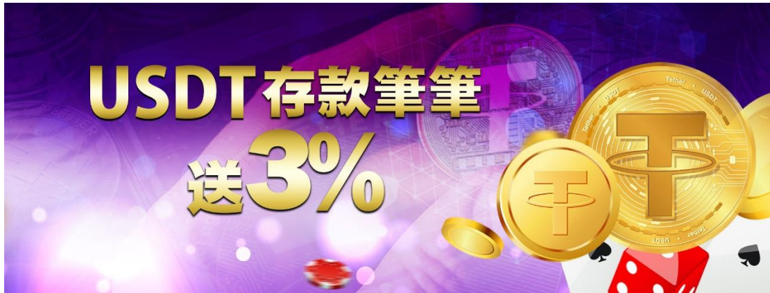
Figure 2 - a typical Tether promotion from an unlicensed betting website targeting Chinese customers offering a 3% rebate over other payment means

The purpose of accepting cryptocurrency as payment for betting thus cannot be seen as anything but a means to enable customers to bet illegally.