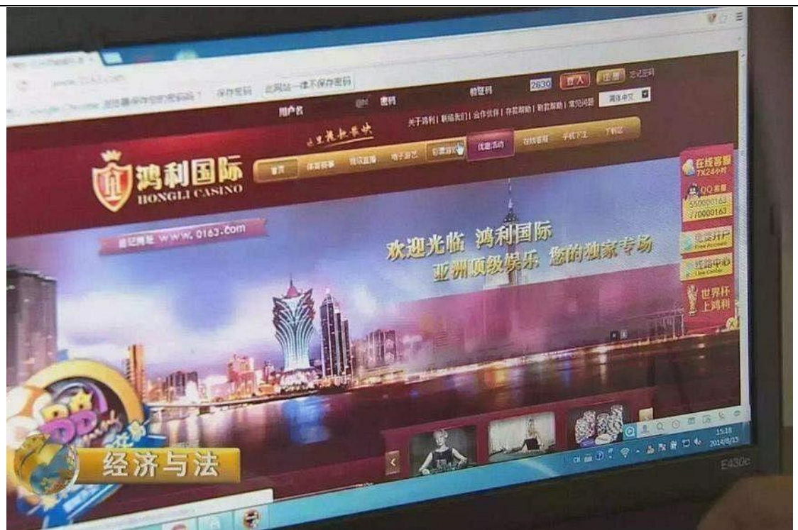
Figure 3 The Hongli International gambling site captured in 2014.

In summary, incredibly large amounts of illicit funds allegedly have been mingled with licit funds and properties around the world, facilitated by cryptocurrency, and almost certainly enabled by slavery.